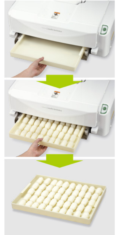
Automated alignment with one button